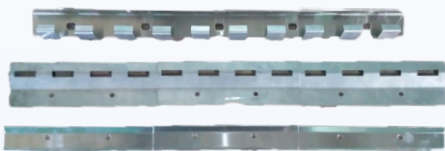
SS PVC Hanger